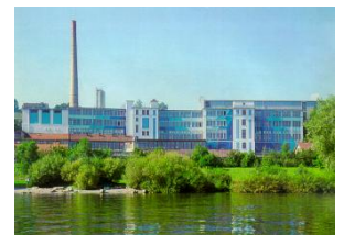
1eEurope (Switzerland) AG Located in Thalwil-Zurich on Lake Zurich

No organization can afford to neglect the enormous potential offered by online collaboration platforms and digital value chains. Our qualified consultants assist you in developing your e-strategy — with workshops, market research, monitoring the competition, and drafting strategic decision-making materials and plans. Within 1eEurope our business-oriented consultants have access to the comprehensive resources and synergies provided by the 1eEurope Team, a team with outstanding technological know-how, in-depth knowledge of market leader products and broad experience of the day-to-day application reality of our international customers.